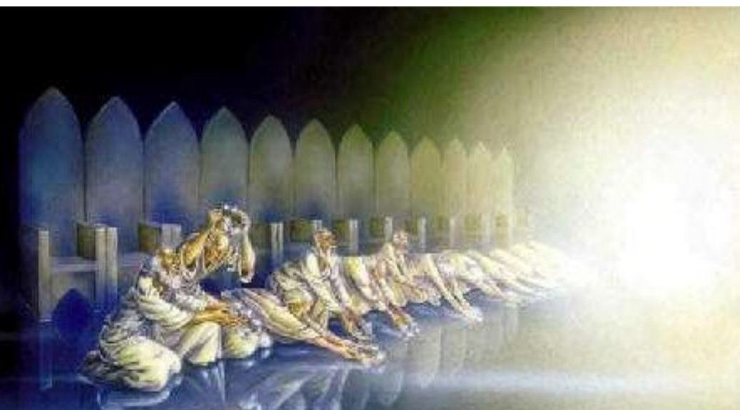
Heavenly Throne Of Worship