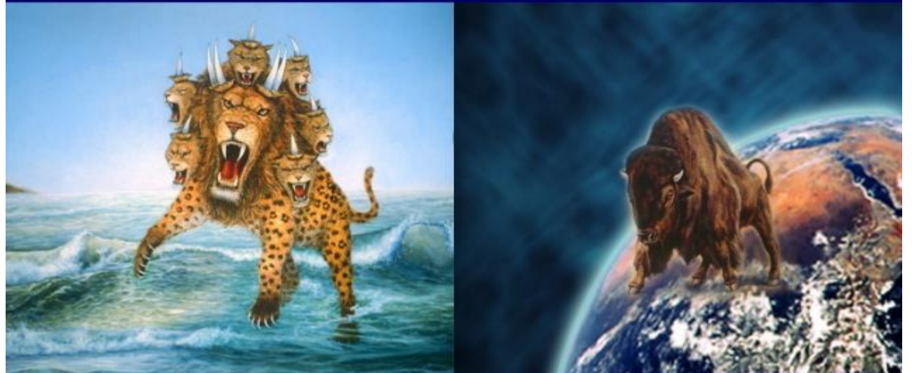
The two Beasts of Revelation 13

Satan, Anti-Christ, False Prophets vs. God, Jesus, Holy Spirit.