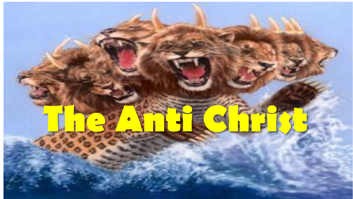
Image and Power of Satan Counterfeit of Christ A Political Leader

And I saw a beast coming out of the sea. He had ten horns and seven heads , with ten crowns on his horns, and on each head a blasphemous name . 2 The beast I saw resembled a leopard , but had feet like those of a bear and a mouth like that of a lion . The dragon gave the beast his power and his throne and great authority.