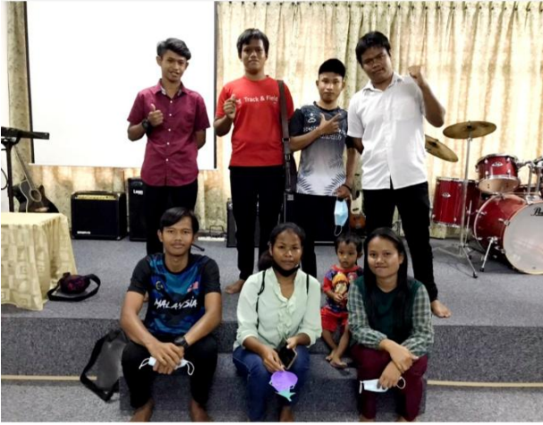
7 OA youths attended training for kindergarten/Sunday school teachers conducted by GMIT in Masai.