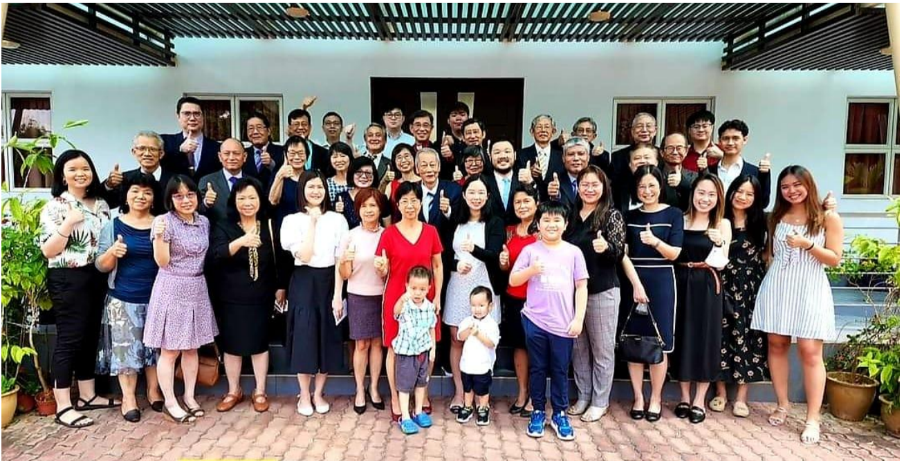
Deacons' Court members & their family members at Easter Service