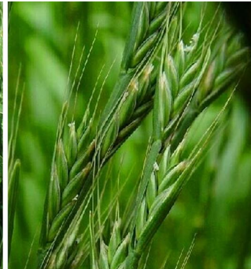
TARES: Lolium Temulentum