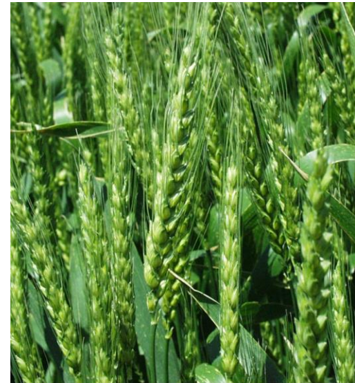
WHEAT: before it is fully ripe.

Wheat and weeds are almost indistinguishable