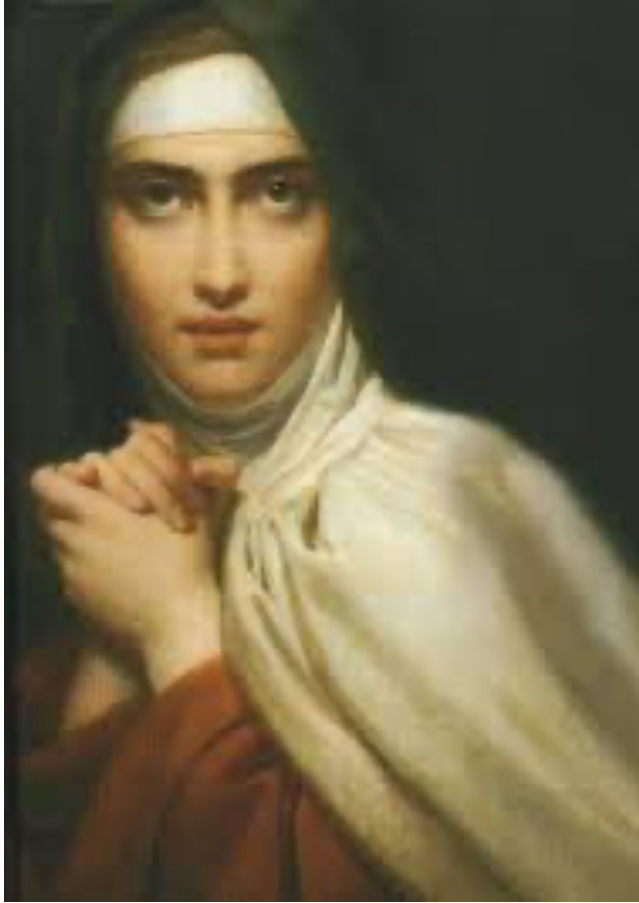
Teresa of Avila

Let nothing disturb you, Let nothing frighten you, All things are passing away: God never changes. Patience obtains all things Whoever has God lacks nothing; God alone suffices.