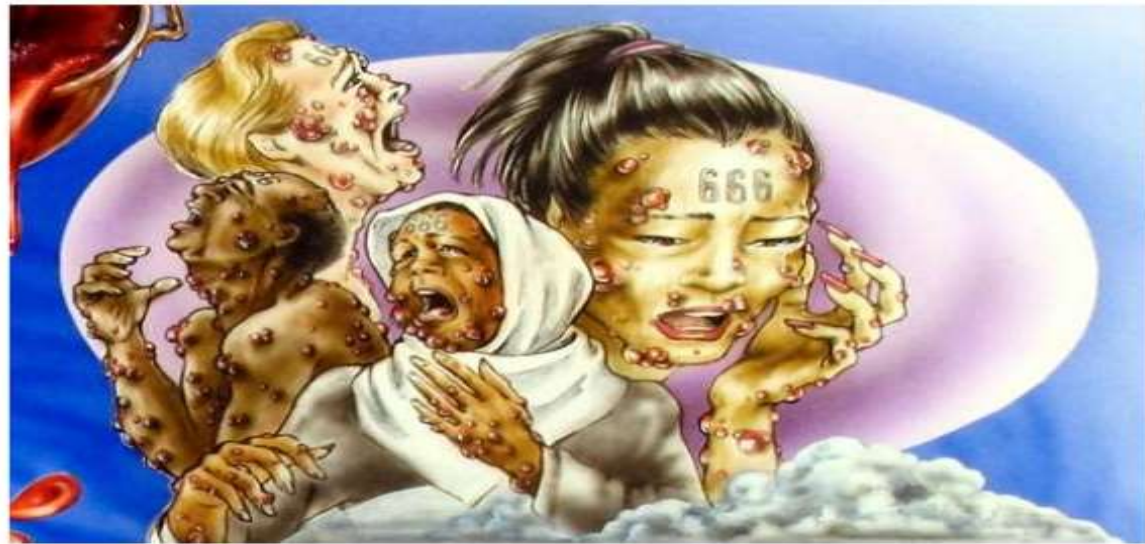
Bowl 1-harmful and painful sores