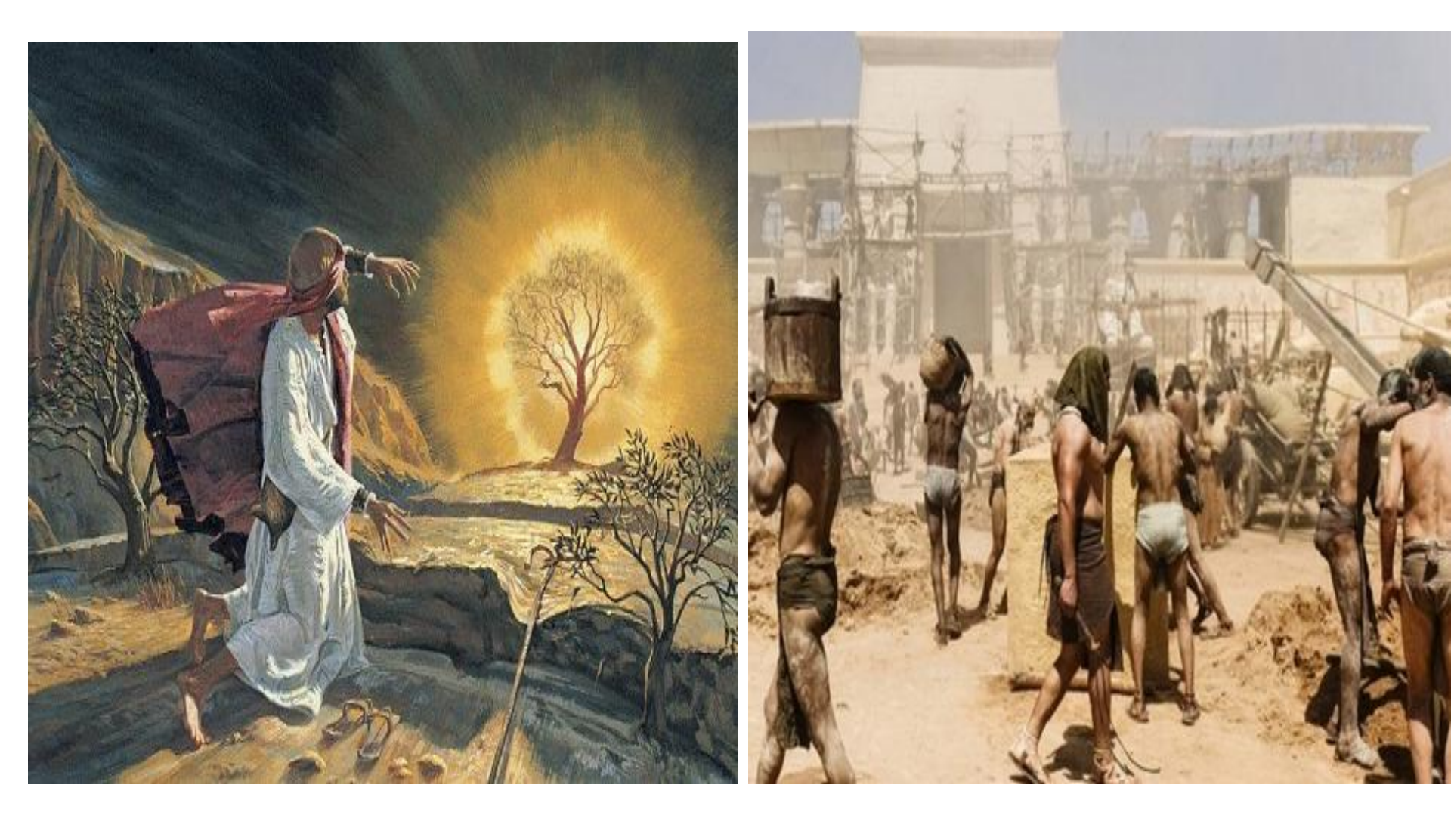
Moses asked. EX3:13