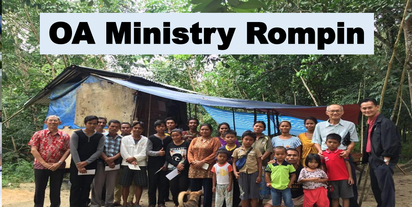
OA Ministry Rompin