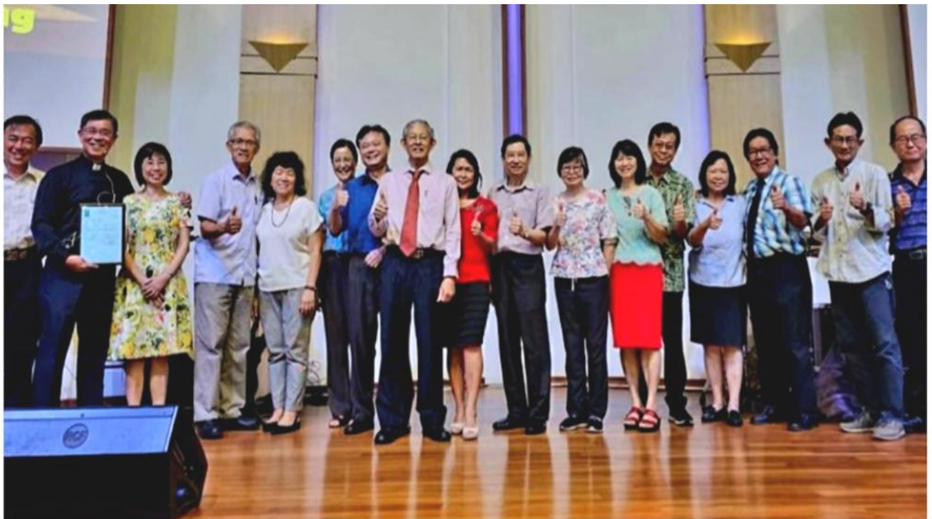
Praise God for the issuance of the Certificate of Completion and Compliance (CCC) for the Faith Hall. 28/5/2023.