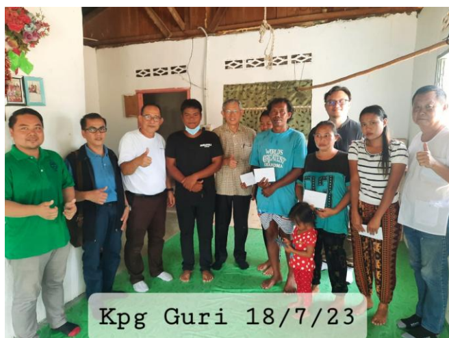
Kpg Guri 18/7/23