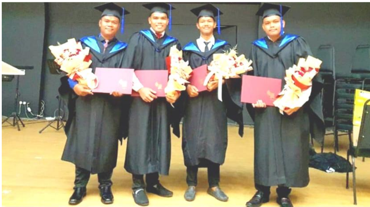
The 4 pastoral workers sponsored by HLCE received their Diploma in Biblical Studies from MTBC on 29.6.2023