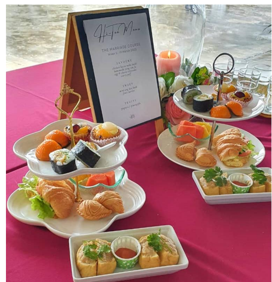
TMC Hi Tea @Berea

I enjoyed all the session topics. I feel all of them cannot be separated. I want to practise and remember all of them every day.